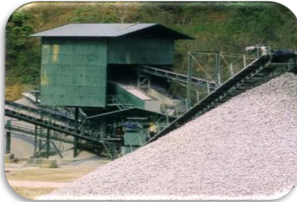
Crushing & Operation