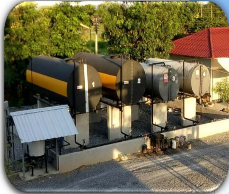
• Factory 2