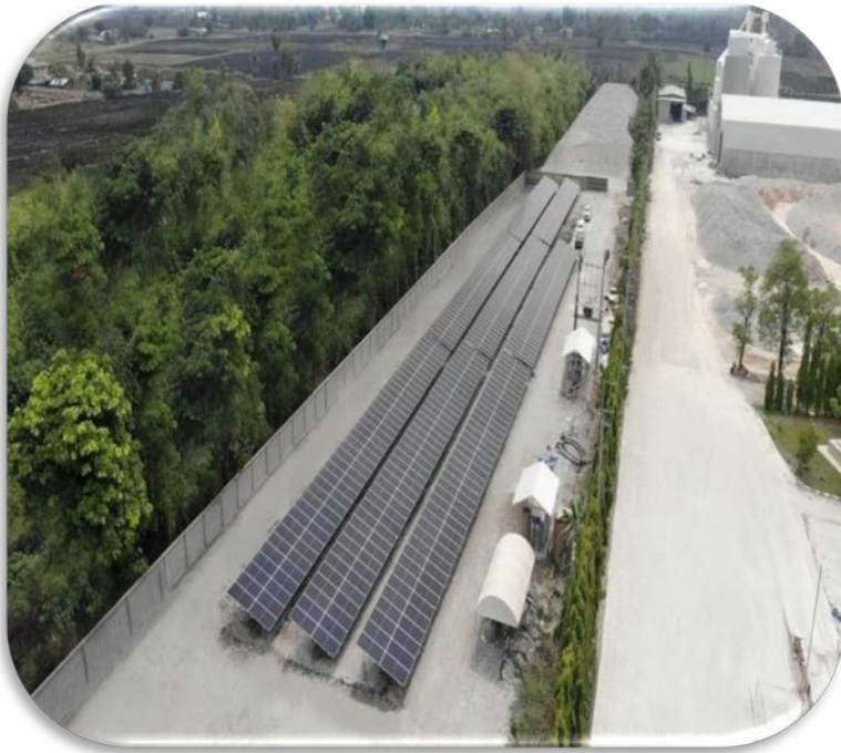
• Factory 1