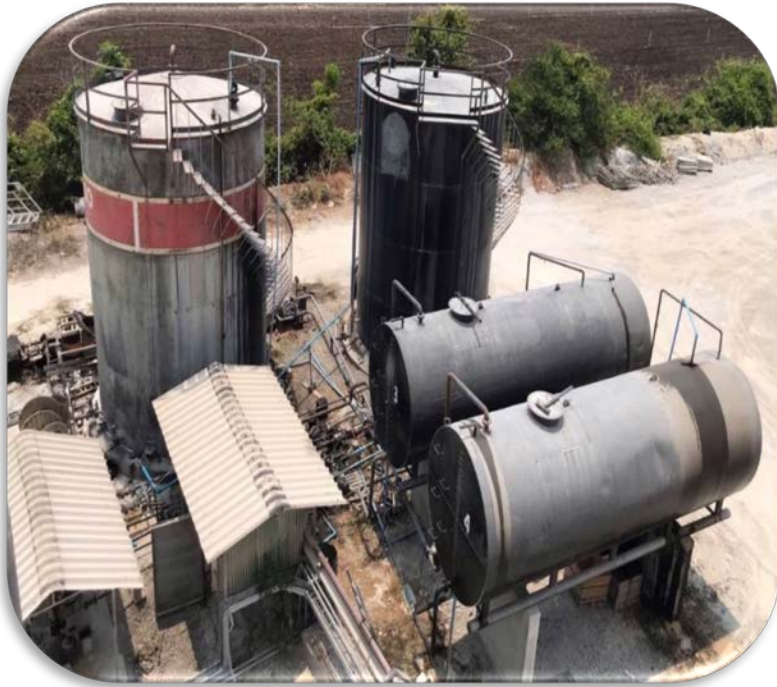
• Factory 1