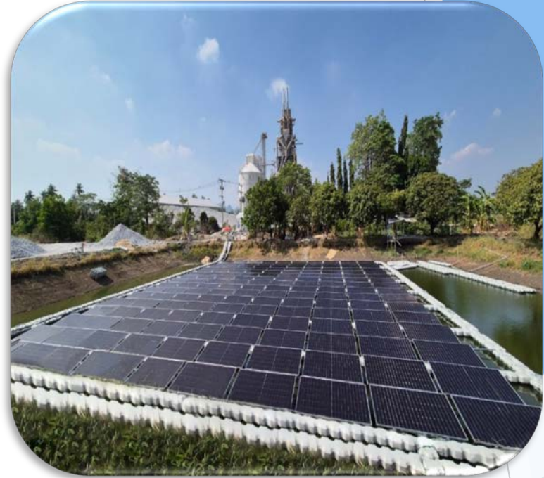
• Factory 2